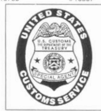
US CUSTOMS SPECIAL AGENT OVAL BADGE #10119