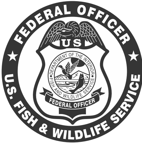
Product #14208 Federal Officer Belt Badge