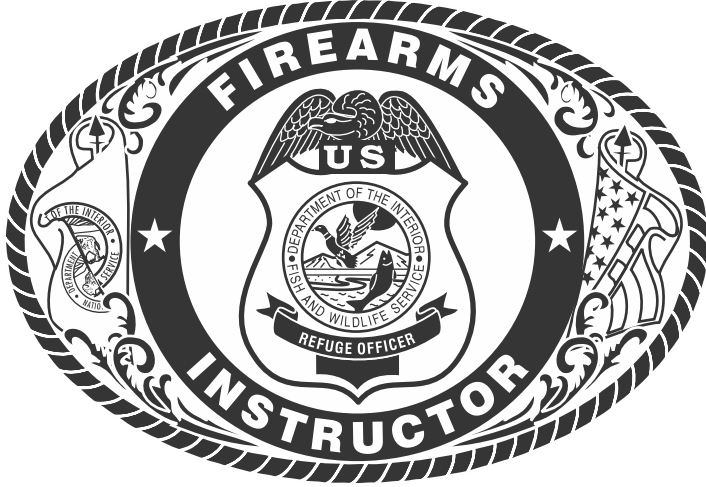
Product #4778 - Firearms Instructor