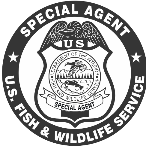
Product #7643 Special Agent Belt Badge