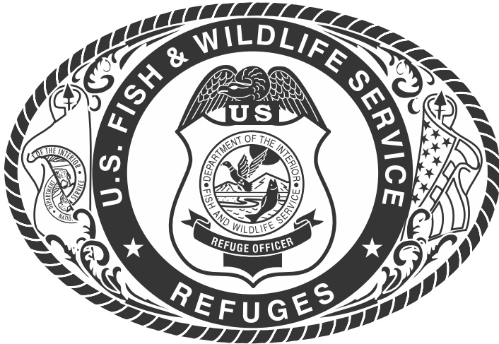
Product #5914 - Service - Refuges