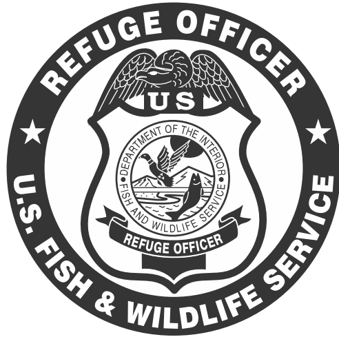
Product #11062 Refuge Officer Belt Badge