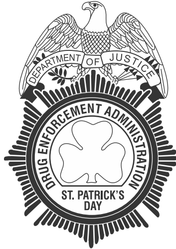
PRODUCT #15201 ST. PATRICK'S DAY NECK BADGE