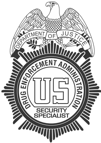
PRODUCT #16506 SECURITY SPECIALIST NECK BADGE