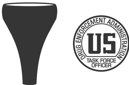
PRODUCT #16560 TFO SIGNET RING